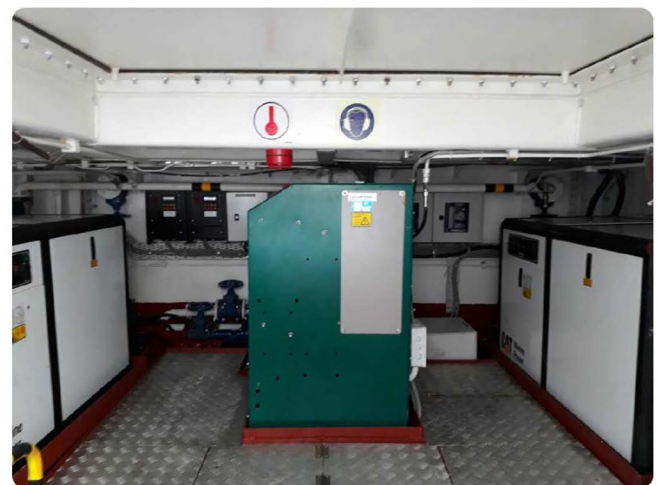
2 no. 28KVA generators and Dive Air Compressor