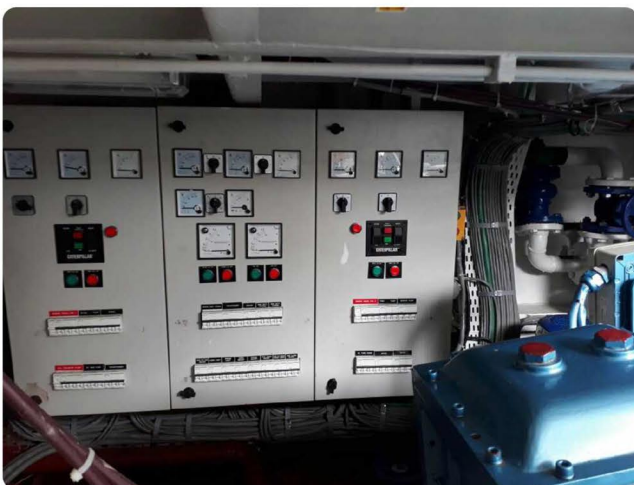
Engine Room Control Panel