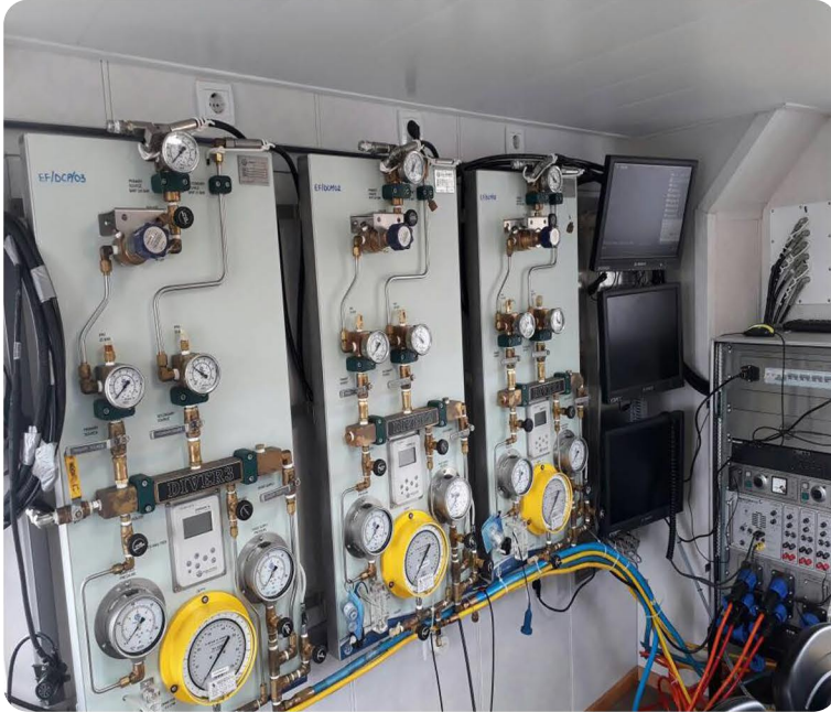
3 Diver Panel and Diver Electrical Rack (Comms, DVR, UPS)